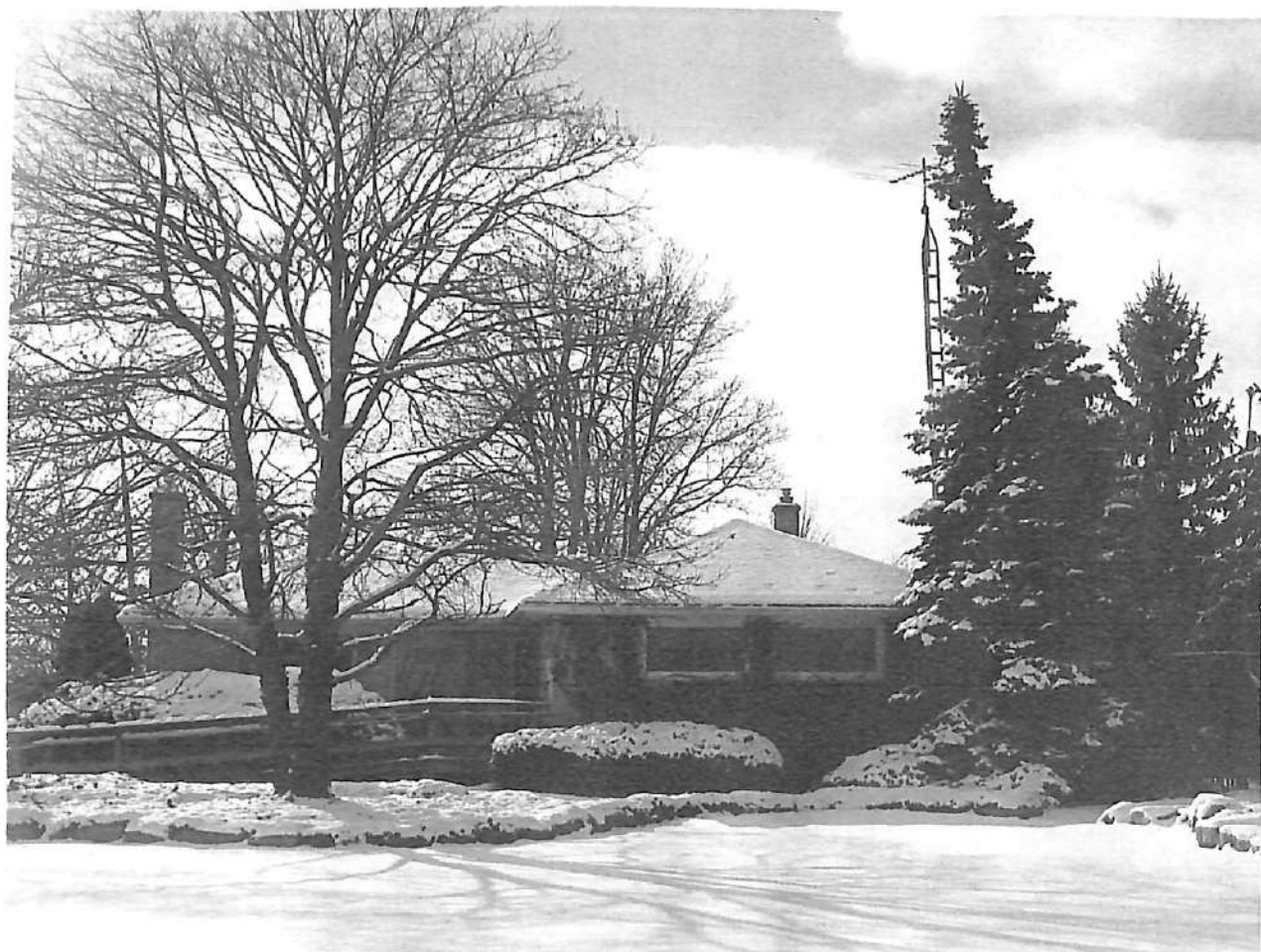
(2010) Pulleyblank Home