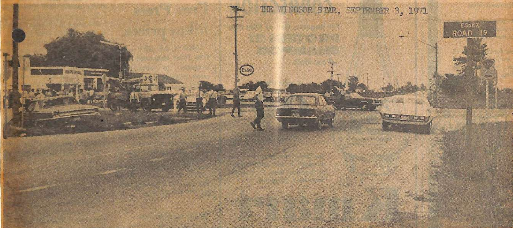
County Roads 19 and 46, where two died in this accident Wednesday is one of the trouble areas