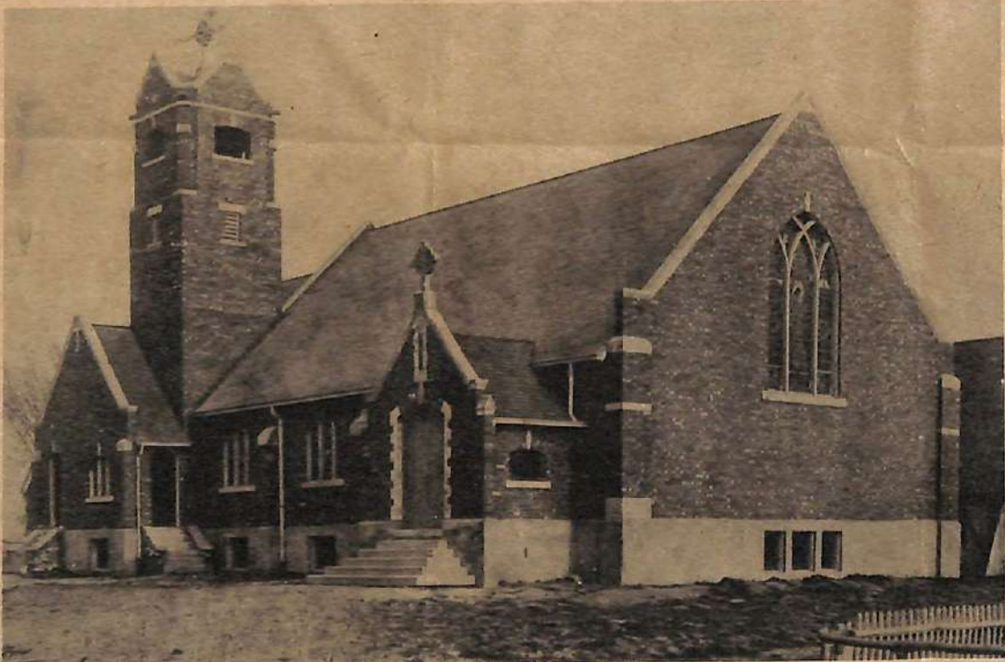
This is the oldest surviving photo of the present St. Stephen's, Oldcastle, and shows at right the corner of the old frame church, not then demolished.