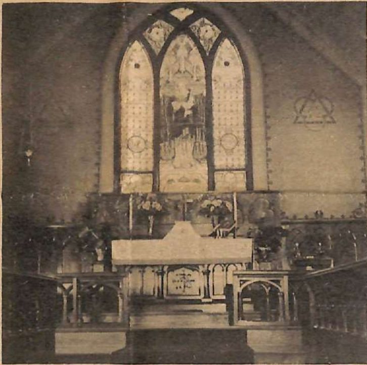
The sanctuary of St. Stephen's, Oldcastle.